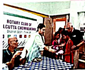
Food Packet Distribution For The School Students