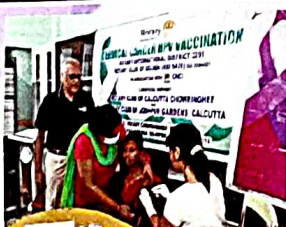
Cervical Cancer Vaccination Given To The Girl Students