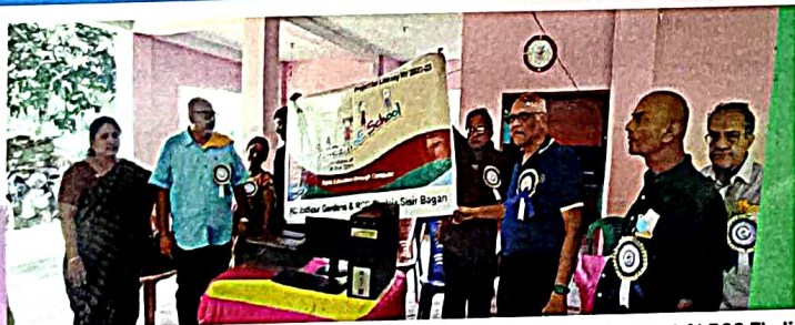
Donating Computer To The Computer Center For The Development Of Student At RCC Thalia