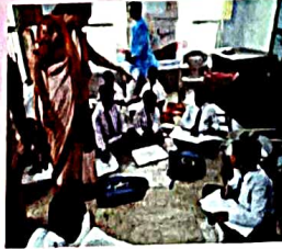
Drawing Class For The Students Of School At RCC