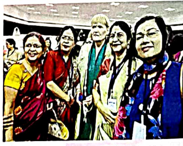
Women Empowerment At Vishaka Vista