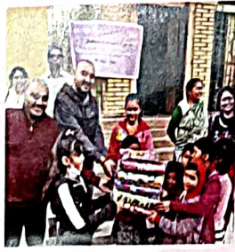
Distribution Of Blankets Among The Childrens