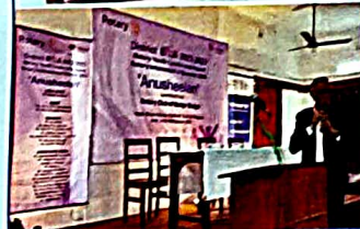
Our Club was the Co-host at District RYLA 2022 - 2023 held on 3rd to 5th Feb, 2023