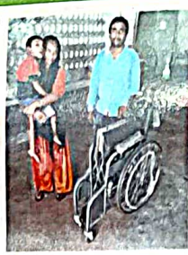
Wheel Chair Distribution