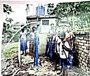
First Flush Of Water For The School Students