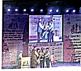
Multi District RCC Conference