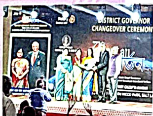
District Governor Change Over Ceremony