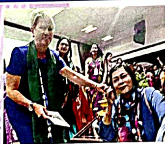
With RI President At Vishaka Vista